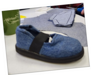
March Sole Hope We used a pattern to cut up old jeans that will be made into shoes for children in Uganda