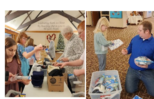
Jan. We made supply packages for the homeless and delivered them to The Landing in Rochester